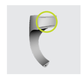
Hollow construction for voluminous objects.

In order to obtain an optimal printing and casting result, pronounced projections, corners and edges should be avoided during construction.