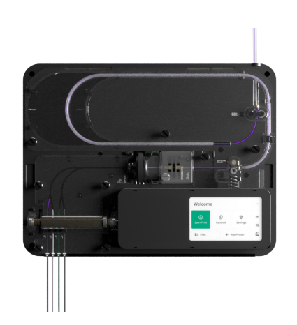
Up to 4 different filaments in a single print job