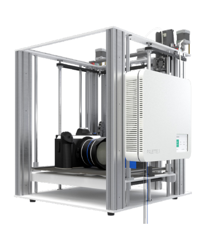
Easily connects to most widely available 3D printers,