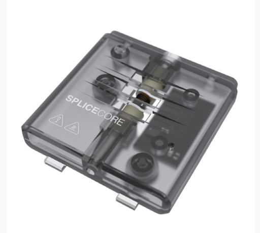
Improved Splice Core for even faster splicing than Palette 2